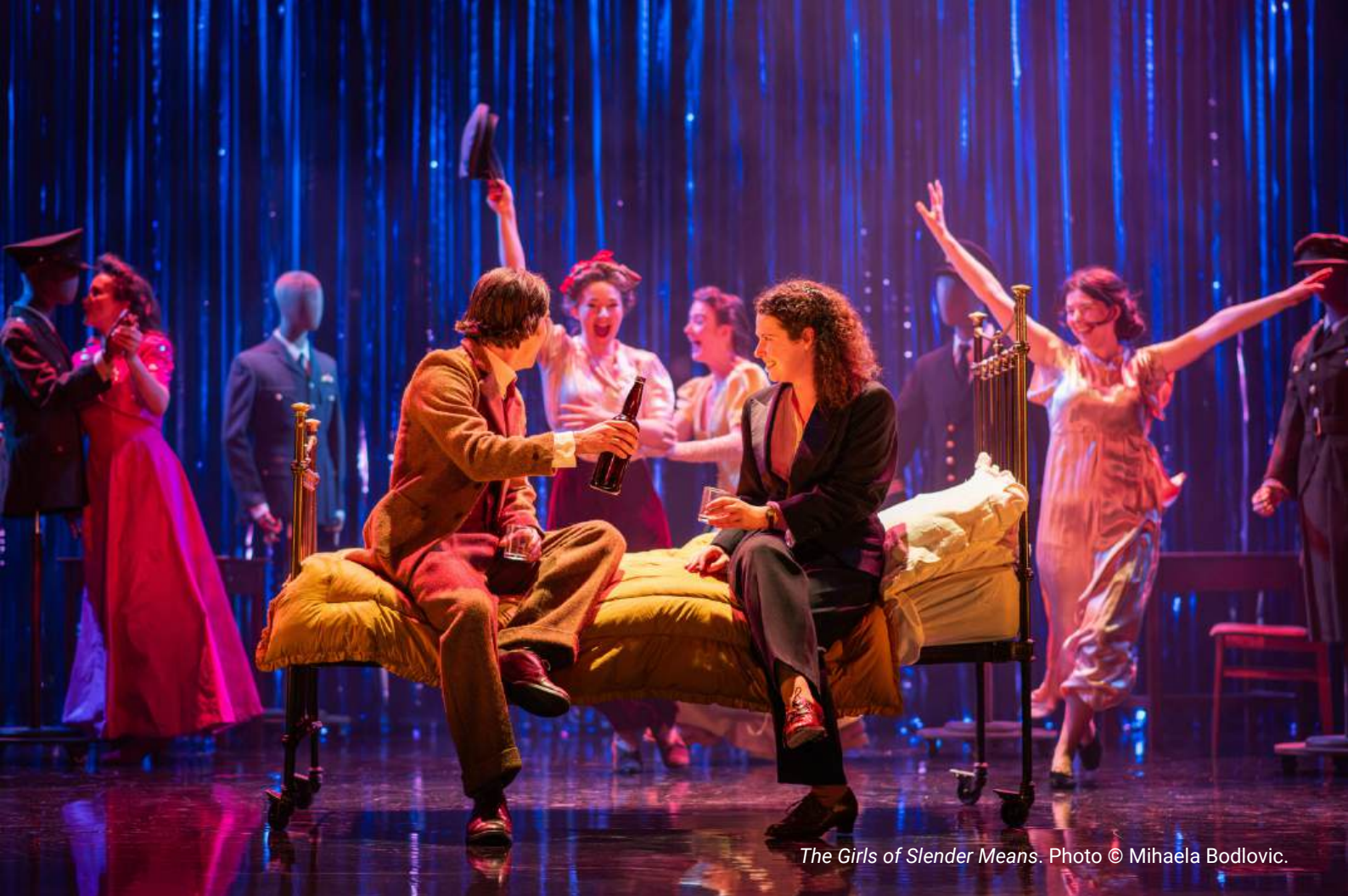
The Girls of Slender Means.