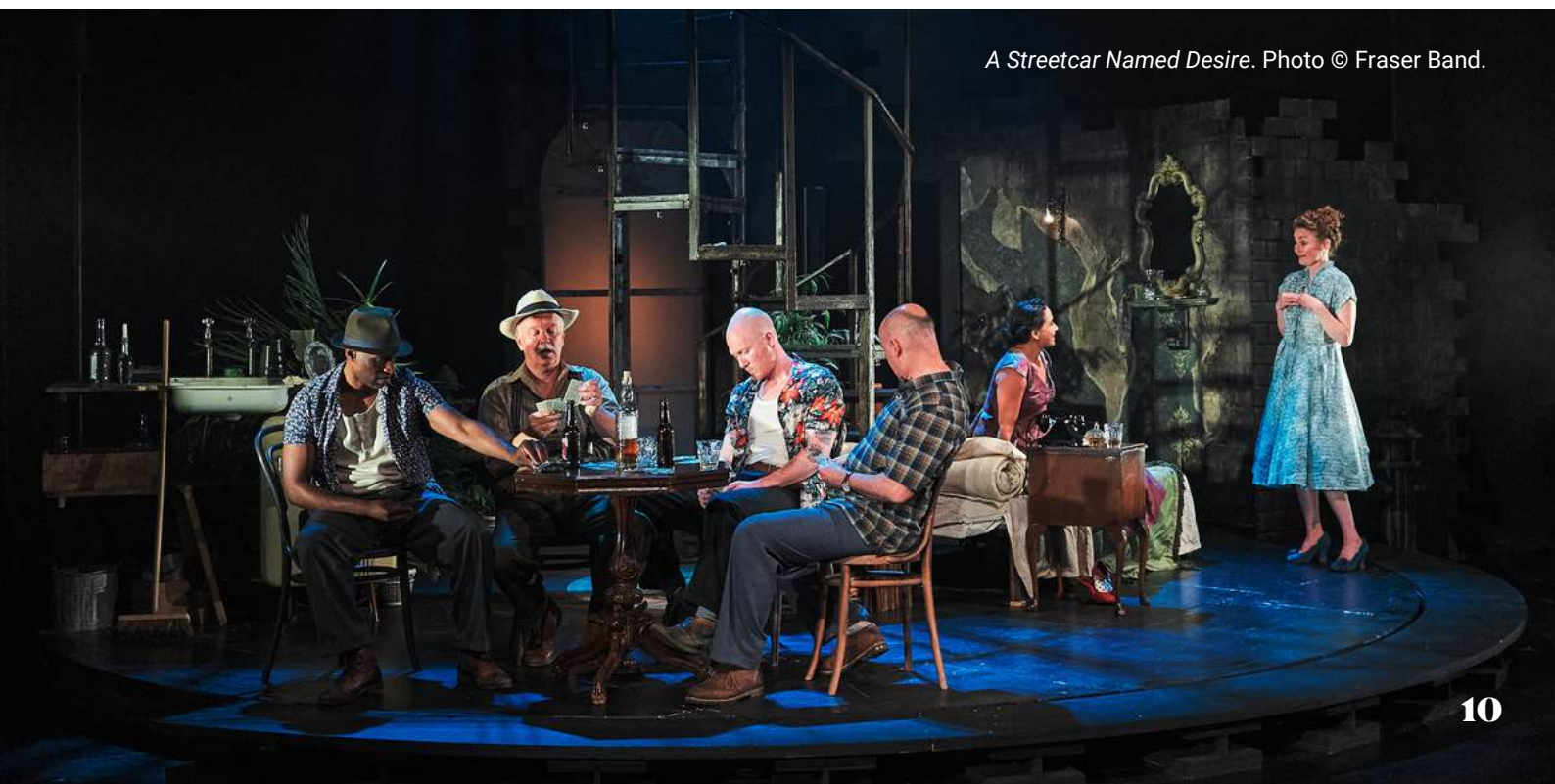
A Streetcar Named Desire.