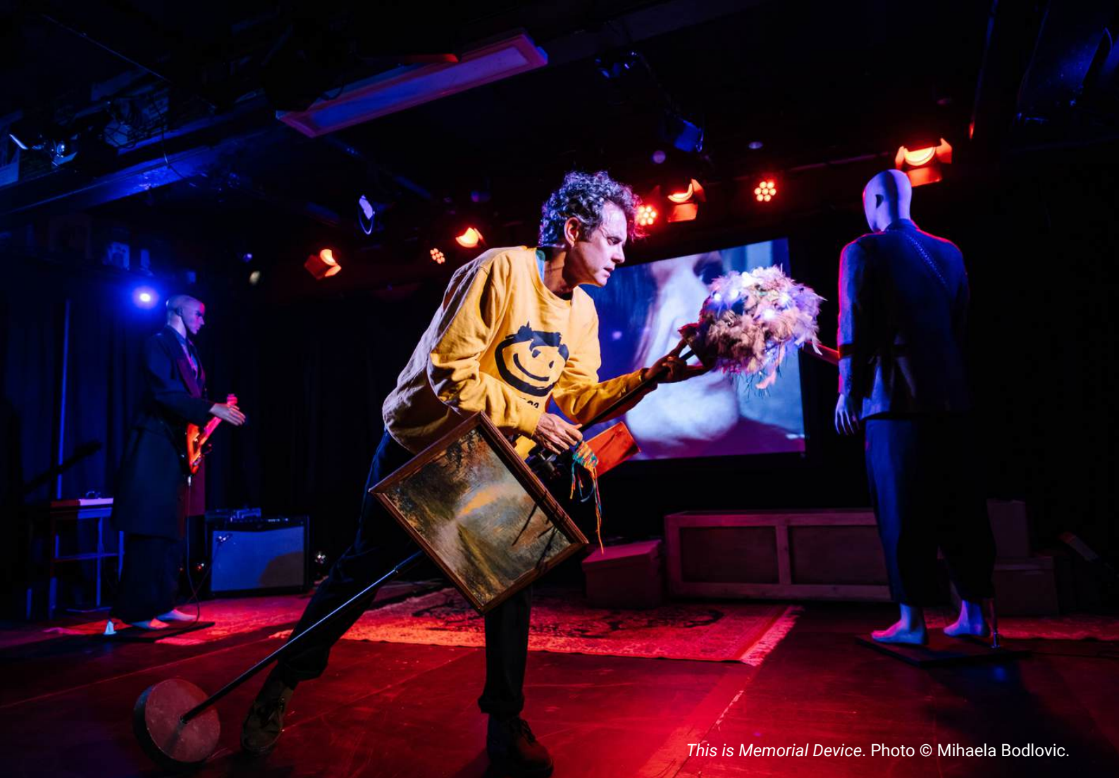
This is Memorial Device.