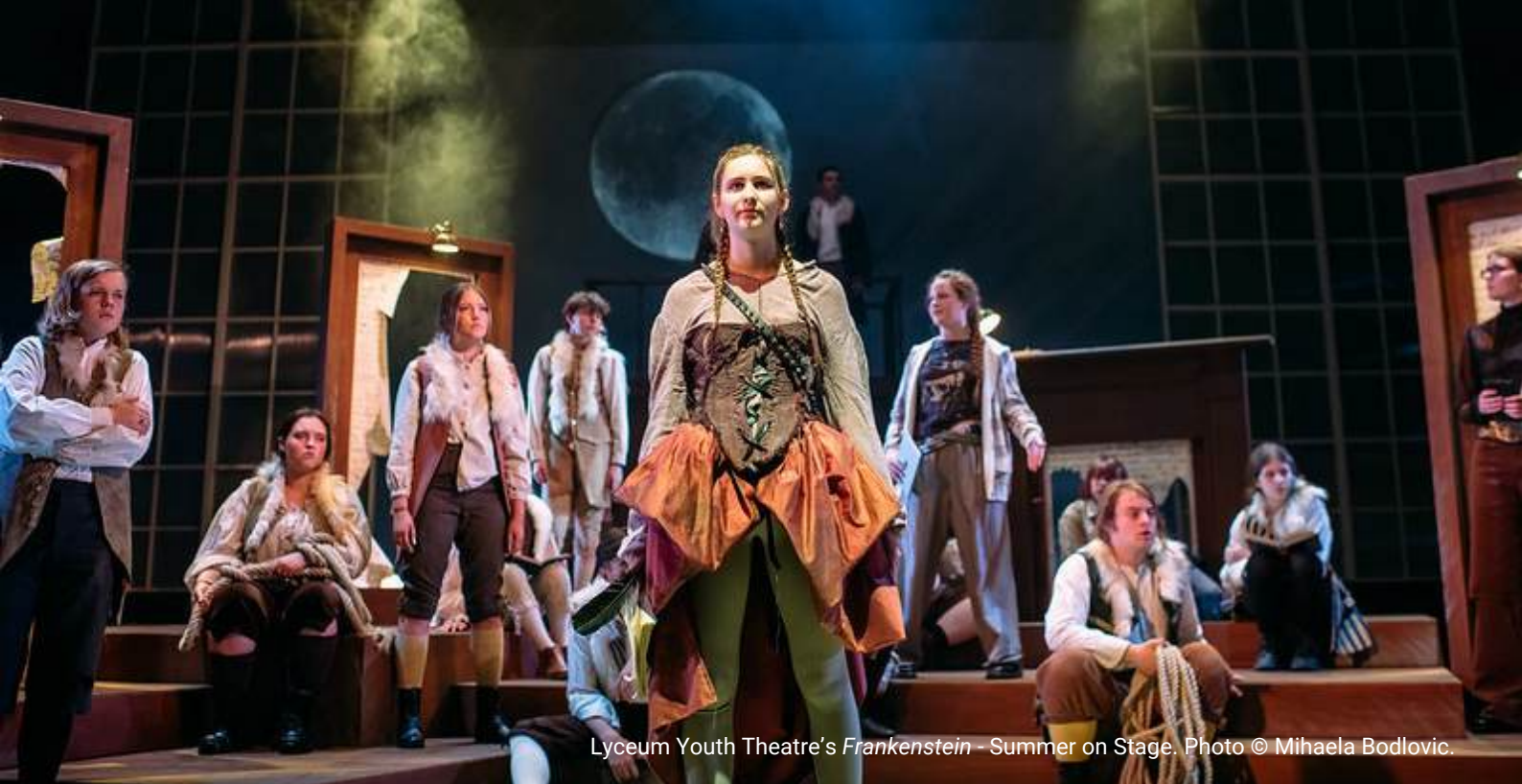
Lyceum Youth Theatre's Frankenstein - Summer on Stage.