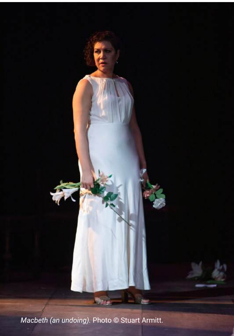
Macbeth (an undoing).