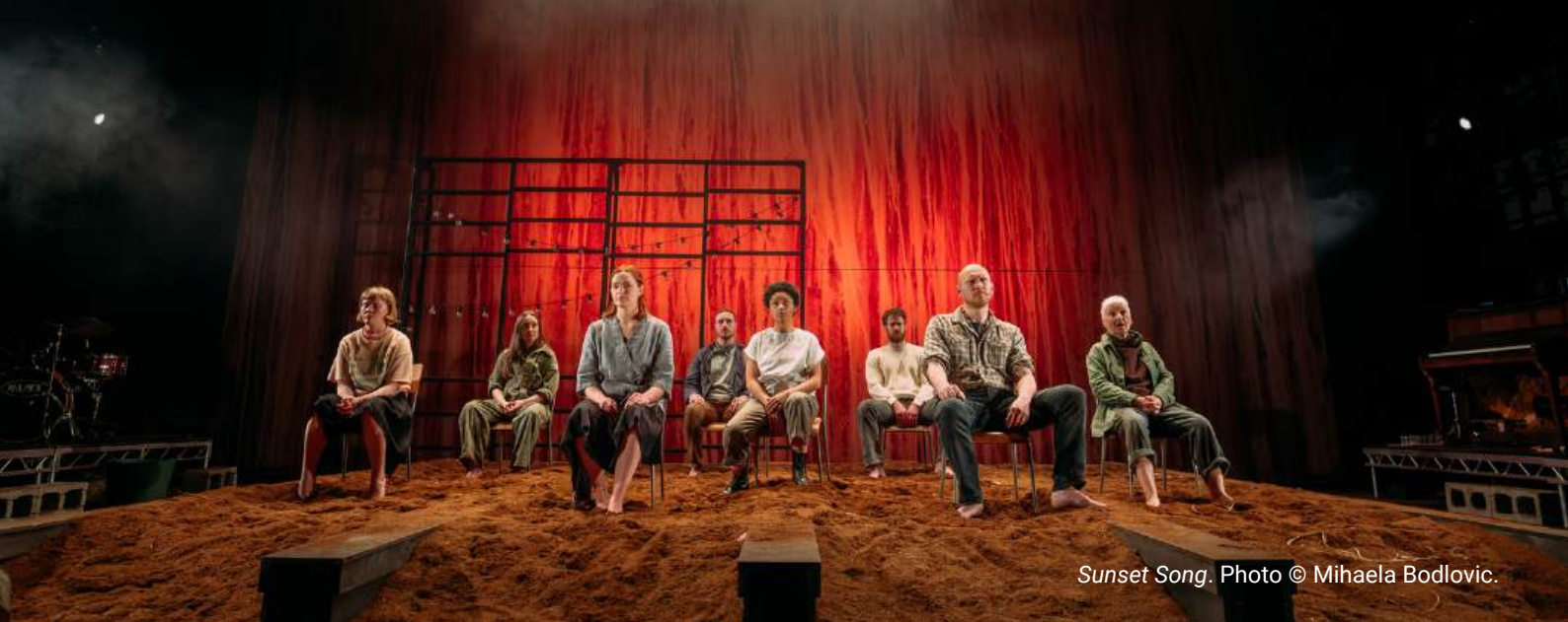
Sunset Song.