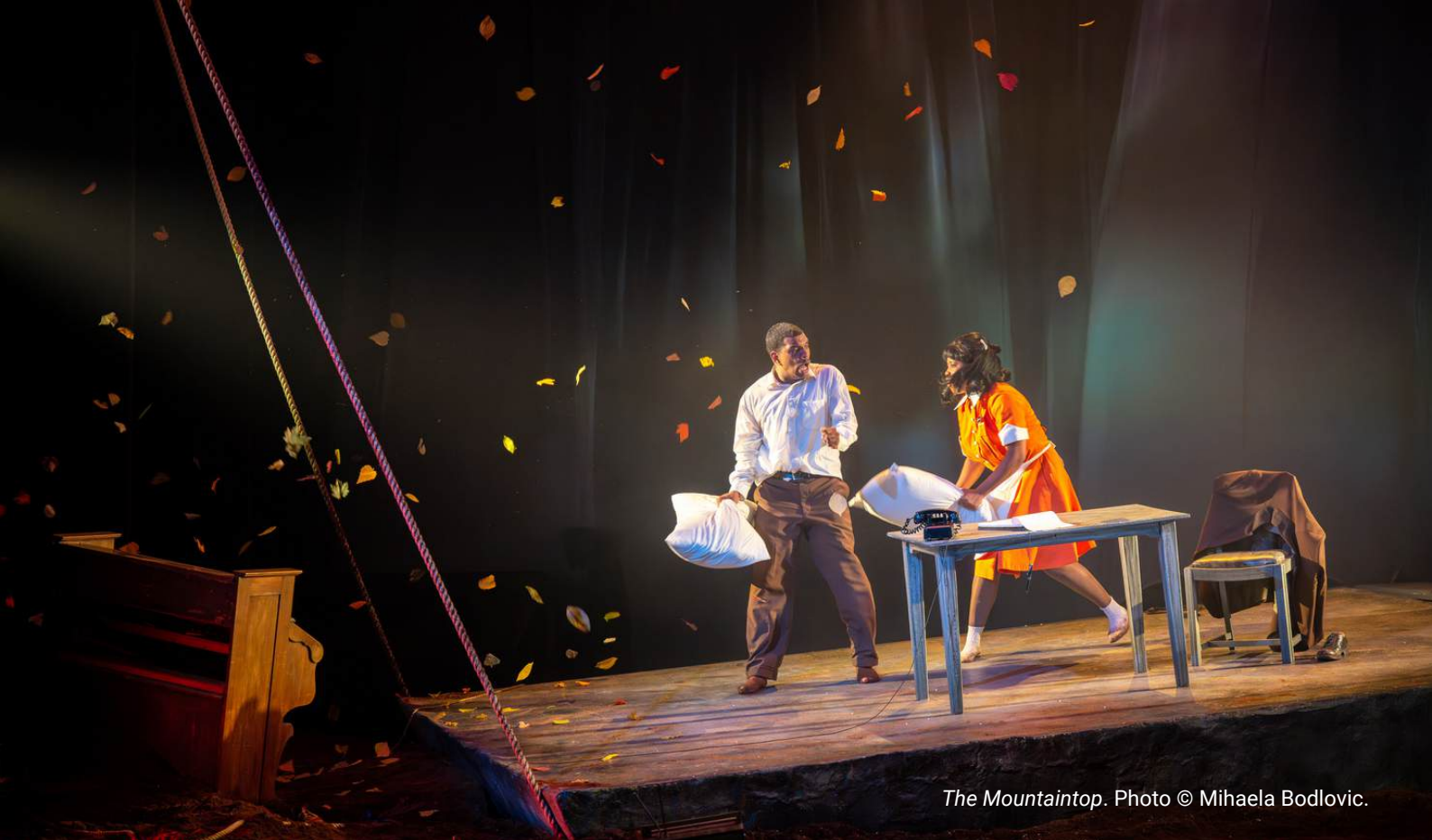
The Mountaintop.