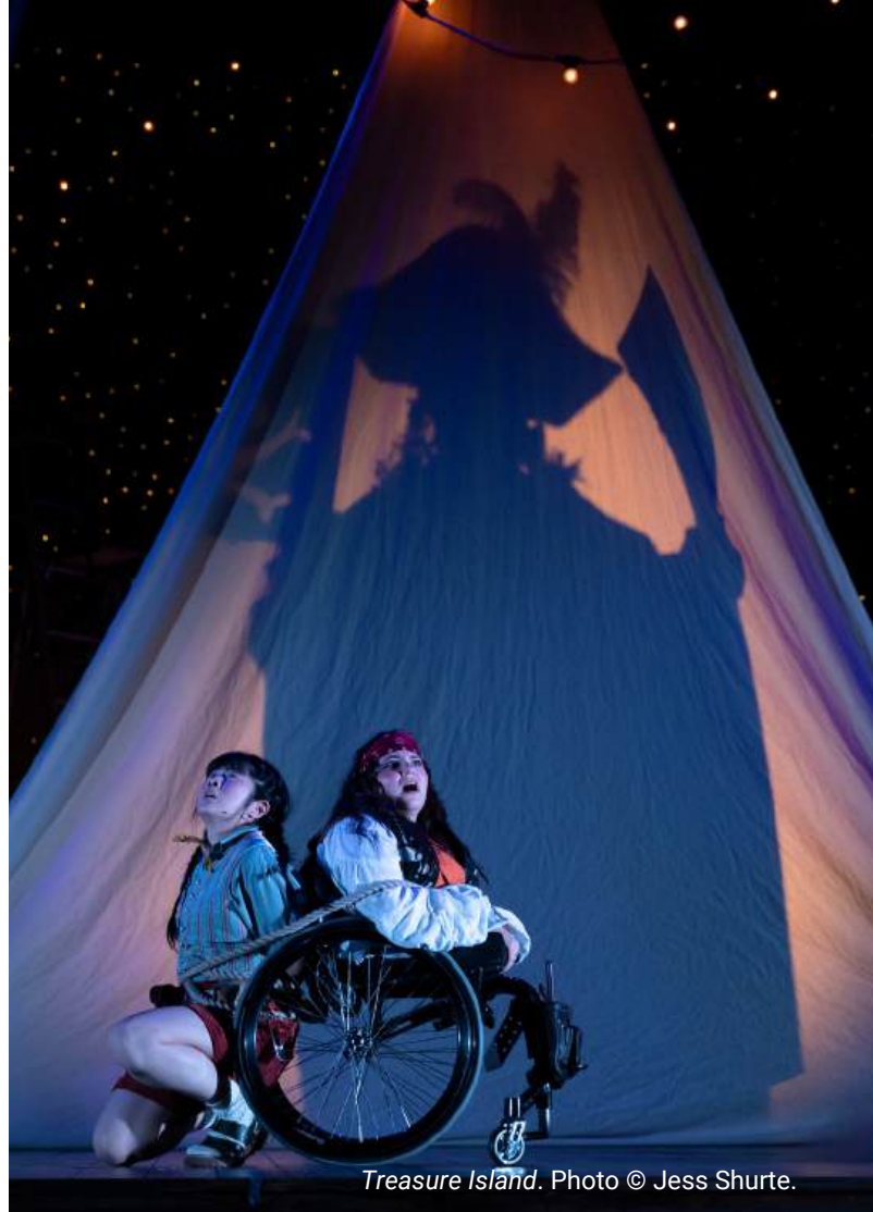
Treasure Island.